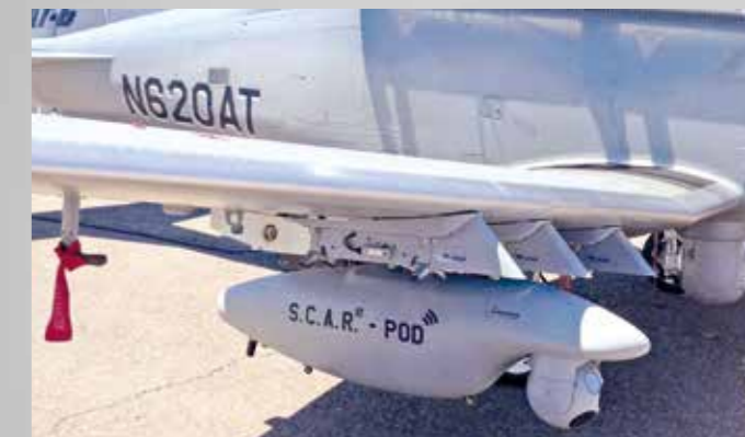
S.C.A.R. – POD on Beechcraft AT-6