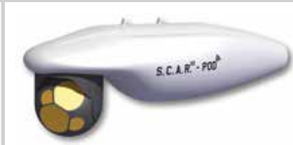
S.C.A.R. 20 – POD