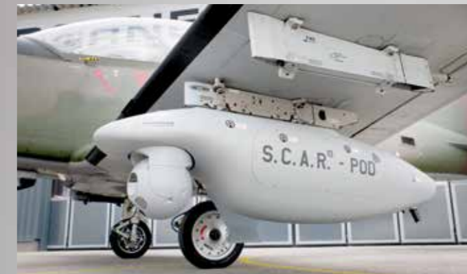
S.C.A.R. – POD on PC-9