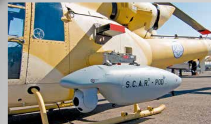
S.C.A.R. – POD on Aerospatiale GAZELLE AS-342