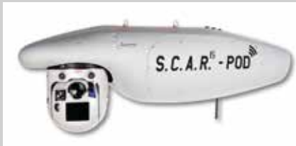
S.C.A.R. 15 – POD

Self Contained Aerial Reconnaissance Pod