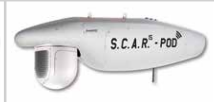
S.C.A.R. 15 – POD with I-Master