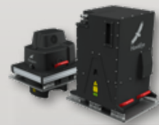
Leica Chiroptera 4X / Leica HawkEye 4X

Do you need your equipment installed and certified in your aircraft? Are you considering to procure a new aircraft and/or sensor equipment ?