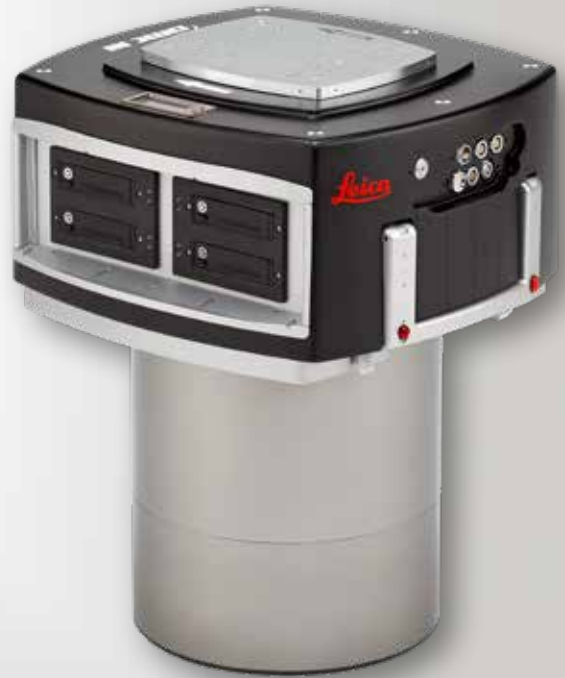
Leica CityMapper, Leica DMCIII, Leica SPL100