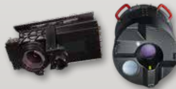
Leica SPL100 Leica TerrainMapper