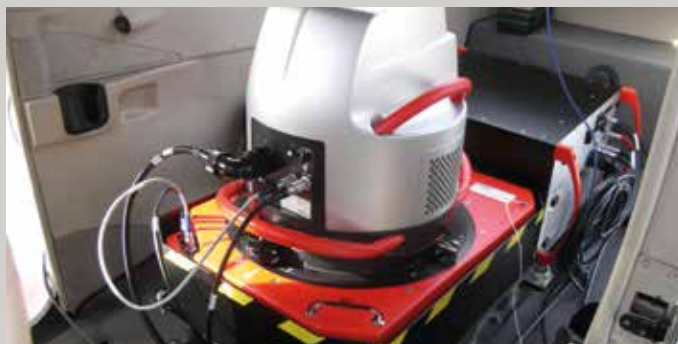
Leica ADS80 in Cessna 182