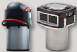
Leica ADS100 Leica DMCIII