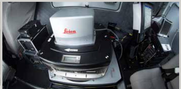
Leica DMCIII in Vulcanair P68